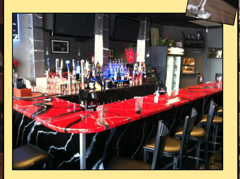
"Coolest Little Bar in East Peoria!"

HOUSE WINE Barefoot—by the glass Merlot • White Zinfandel • Chardonnay